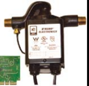
Electronics Make the Difference

The Metlund® D'MAND® System is designed to move the hot water from your most remote fixture on D'MAND® within seconds!